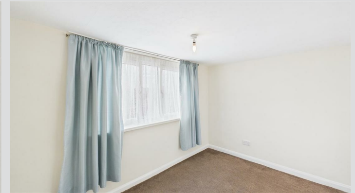
Bedroom 2 10'7" x 7'9"